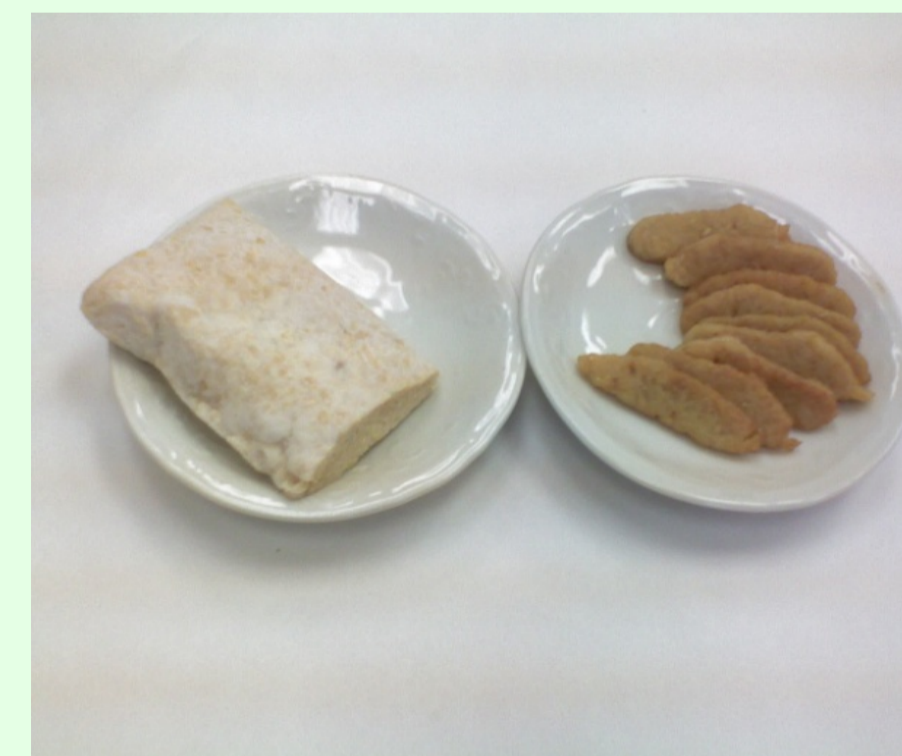
Figure 3: grass pea tempeh

References Campbell, C.G. 1997. Grass pea. Lathyrus sativus L. Promoting the conservation and use of underutilized and neglected crops. 18. Institute of Plant Genetics and Crop Plant Research, Gatersleben/International Plant Genetic Resources Institute, Rome, Italy. Dalgetty, D.D. & Baik, B.K. 2006. Fortification of Bread with Hulls and Cotyledon Fibers Isolated from Peas, Lentils and Chickpeas. Cereal Chemistry , 83(3), 269. TOP CULTURES, firm publication, http://www.tempeh.info . Hussain, M., Chowdhury, B. Haque, R., Wouters, G., & Campbell, C.G. 1994. Comparative Study of the O-Phthalaldehyde Method for the Neurotoxin 3-N-L-2,3-Diaminopropionic Acid as Modified by Various Laboratories. Phytochem. Anal. , 5, 247–250. Messina, M.J. 1999. Legumes and soybeans: overview of their nutritional profiles and health effects. J. Am. J. Clin. Nutr. 70 (suppl): 439S–50S. Srivastava, S. & Khokhar, S. 1996. Effect of processing on the reduction of β-ODAP (β-N-oxalyl-L-2,3-diaminopropionic acid) and anti-nutrients of khesari dhal, Lathyrus sativus . J. Sci. Food Agric. 71, 50-58. Yan, Z.Y., Spencer, P.S., Li, Z.X., Liang, Y.M., Wang, Y.F., Wang, Ch.Y., & Li, F.M. 2006. Lathyrus sativus (grass pea) and its neurotoxin ODAP. Phytochemistry , 67, 107-121.